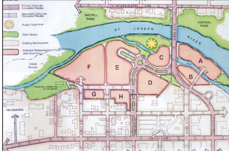
The Uniroyal site in Mishawaka was an industrial stronghold for years. Cleanup has taken place to restore the land, with a plan in place for development and green space in the key spot along the St. Joseph River.